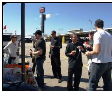
Lunchtime brings out the carnivores!