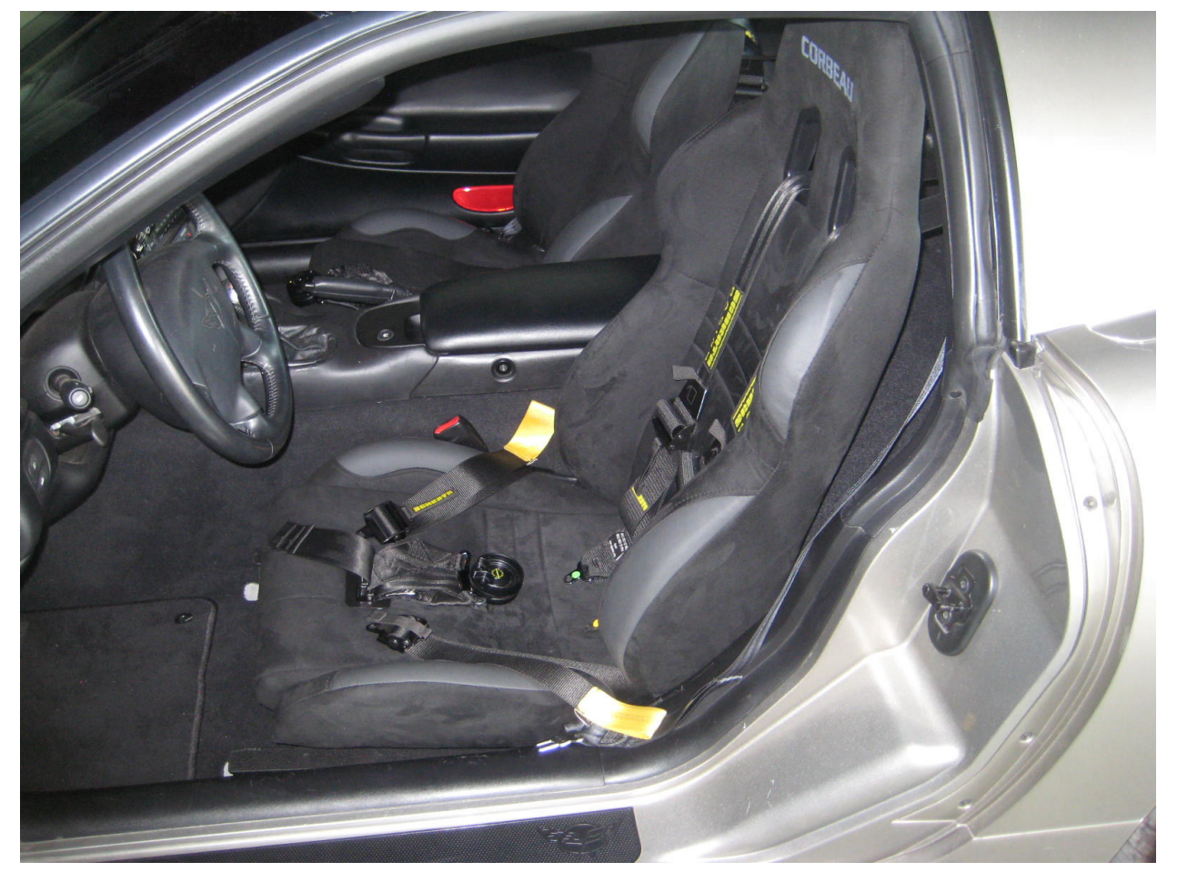
One last shot of the install:

Now everyone knows that the rear outboard seat mounting stud is too short to mount a seat frame and a harness bar reaction restraint bar. My fix was to grind the head off the stud under the car and replace it with a 40mm long 10mm bolt. Grind and beat grind and beat. Need to add a little sealer when installing the bolt.