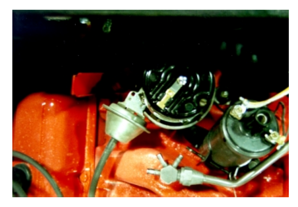
Figure 1: Distributor & Rotor Correctly Installed at #1 Firing Position