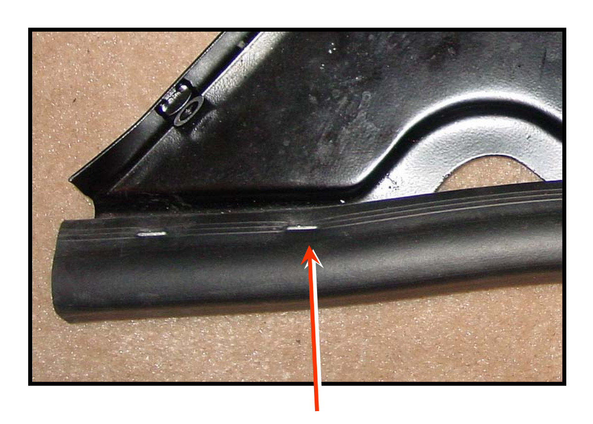
Finished staples top and bottom