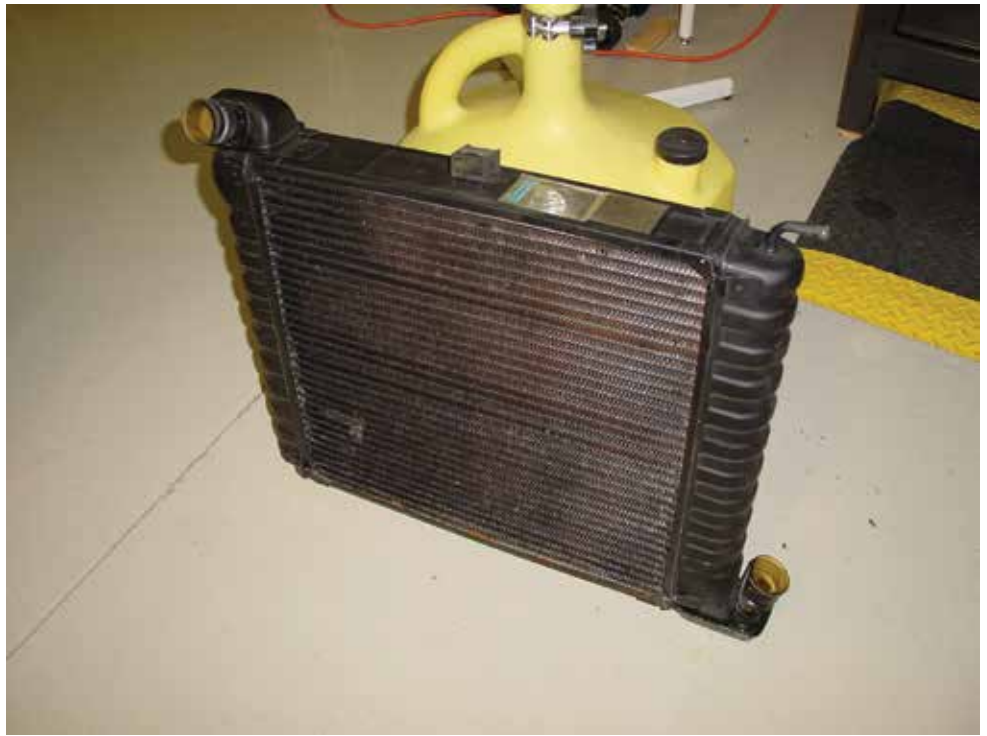
A typical look-alike copper/brass replacement radiator; note the rounded/stamped end tanks. These have about 30% less cooling capacity than the original Harrison aluminum radiator.

Conventional copper/brass radiators with fill openings