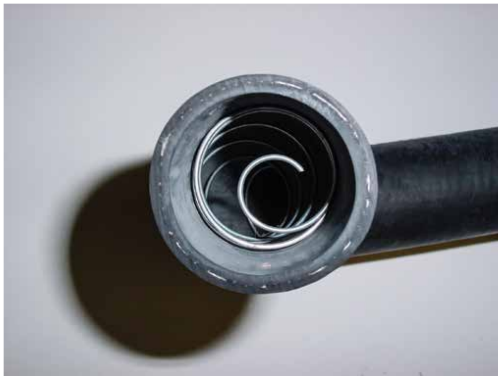
Original lower radiator hoses had this coiled steel wire reinforcement to prevent collapse. Modern hoses are made from better materials and generally don't need it.

Managing airflow through and across the entire surface of the radiator core is the fan shroud's job, especially at idle and at low speed in traffic (in combination with the fan). The shroud must be the correct part to fit the radiator configuration, and the gaps between the two should be sealed with foam strips or rubber flaps so the fan forces all incoming airflow through the radiator core, not around it. The radiator itself should also be sealed to the radiator support for the same reason, and most original A/C installations included these seals. Many configurations also have a rubber flap or foam seal between the top of the radiator support and the hood inner panel; this eliminates that gap when the hood is closed and does two things. It closes off another path for outside airflow to go over (instead of through) the radiator, and it stops the phenomenon where hot underhood air is drawn over the