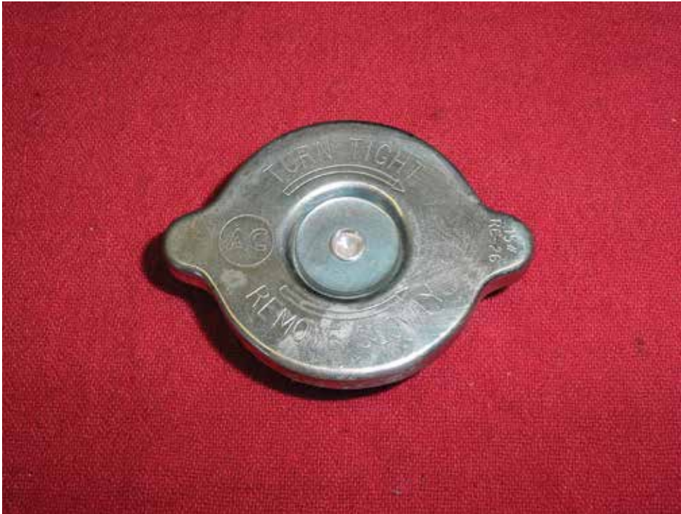
The radiator cap, which maintains system pressure, vents overflow and admits air on cool down. Most auto parts stores can verify its seal and pressure calibration.

Balanced-Flow thermostats like Robertshaw makes (also sold by Mr. Gasket with their name on them) are calibrated much more accurately than conventional parts-store thermostats and will maintain a constant coolant temperature with little or no detectable cycling. Although most thermostats are very reliable, they fail closed, which can cause a lot of engine damage in a big hurry if you don't spot the sudden temperature rise.