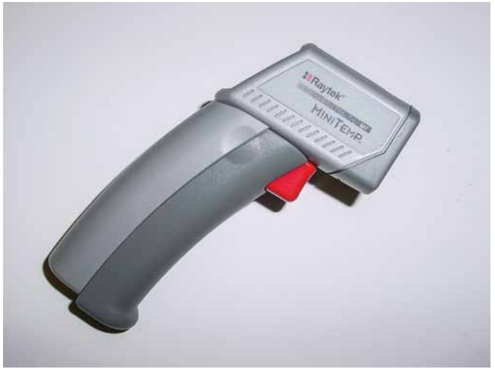
The Raytek MT-4 infra-red temperature gun is the best cooling system diagnostic tool you can buy for verifying coolant and component temperatures.

Without going into gory detail, the cure for this is to connect the distributor vacuum advance to full manifold vacuum and re-adjust idle speed and mixture screws to reduce exhaust gas temperature and stabilize the idle with