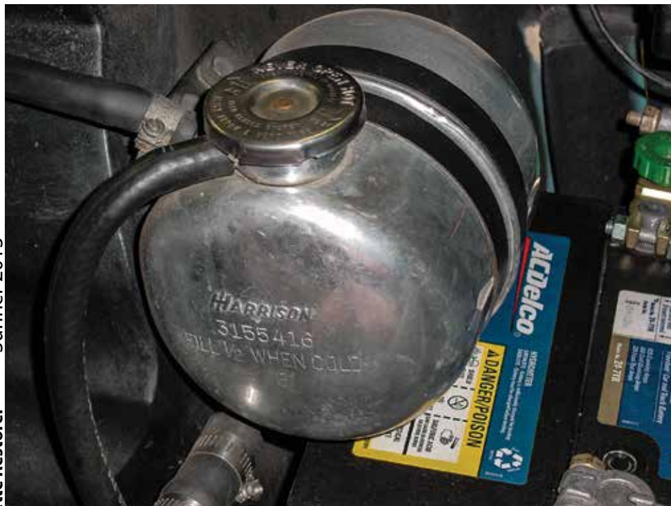
The Harrison aluminum expansion tank with the inlet and overflow at the top and the outlet at the bottom. Only fill half full when cold or it may puke coolant out the overflow during hot-soak.

Note that the expansion tank is stamped Fill ½ when cold on the inboard end. If you fill it all the way or top it off when cold, there's no room for expansion of hot coolant, and coolant will puke out