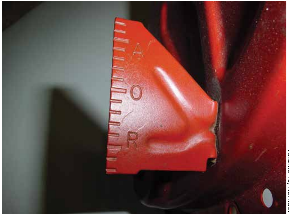
Setting correct initial timing and ensuring that vacuum advance unit is fully deployed at idle are essential for maximum idle and low-speed cooling performance.

John Hinckley NCRS# 29964 Snake488@aol.com