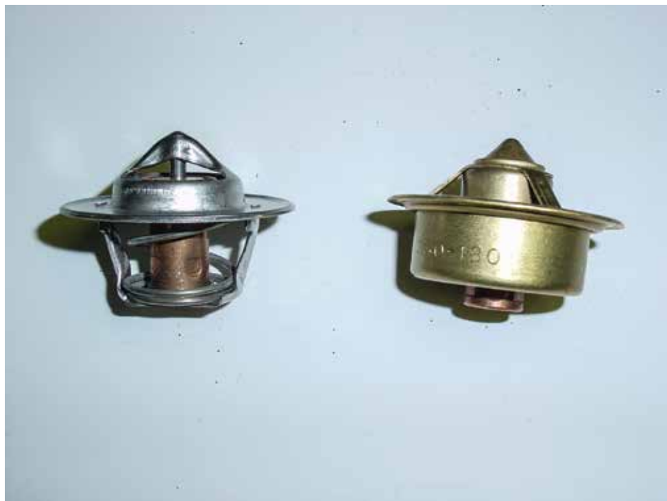
A conventional thermostat on the left and a balanced-flow type on the right; the balanced-flow type is more accurately calibrated.

an 800-hp engine. You don't need that on the street, and race-pump impellers are much less efficient at normal street operating rpm than the impeller in a stock factory pump. If the pump leaks, either have it rebuilt or replace it. Water pumps are hardly ever the cause of a cooling problem, unless they're really ancient and the impeller blades have corroded away.