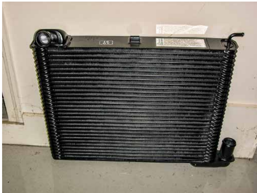
The extremely efficient Harrison stacked-plate aluminum radiator basic design was used from 1960-1972, and all versions are reproduced by DeWitts.

Your Corvette was designed to use a 50-50 mix of ethylene glycol-based coolant/anti-freeze (the green stuff). The anti-freeze component doesn't wear out over time, but the additive package (primarily anti-corrosion elements) does. It gets weaker as it does its job, and if it isn't renewed regularly, scale and corrosion will begin to build up in the radiator tubes, which will drastically reduce the radiator's heat transfer efficiency. The buildup of scale and corrosion acts as an insulator inside the tubes, reducing the rate of heat transfer from the coolant to the air. It's a good idea to drain, flush, and replace coolant mix every two or three years to maintain the effectiveness of the anti-corrosion inhibitor package. The 50-50 mix of coolant also provides boil-over protection, as that mix, with a 15# radiator cap, raises the coolant's boiling point to 265 degrees to prevent puking coolant out the overflow hose during heat-soak after shutdown when the water pump is no longer circulating coolant through the radiator.