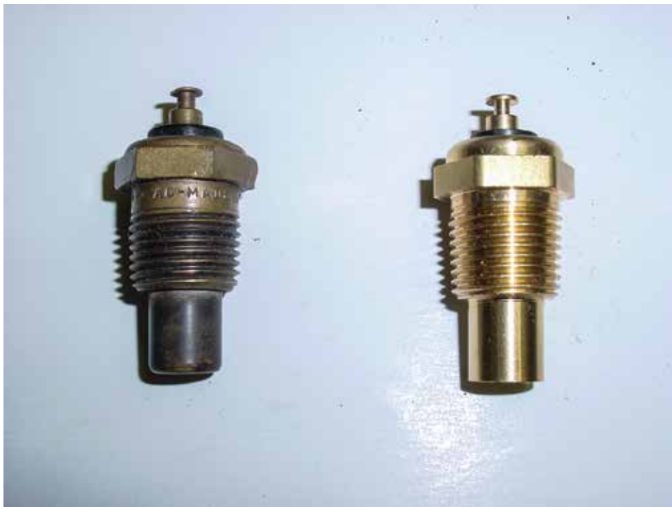
The original AC temp sending unit on the left, and a Wells TU-5 replacement on the right; calibration of replacements is always suspect; check the gauge reading against an I.R. gun shot of the upper radiator hose.

When the sender and gauge were made, they were calibrated to a standard value so they worked together to provide a reasonably accurate indication, but they are not laboratory-standard precision instruments. Age, dust, dirt and moisture affect the gauge movement and its electrical components, and the sending units also deteriorate with the years. Replacement sending units are not accurately calibrated to match the gauge, and almost all of them cause the gauge to read 20-40 degrees too high, although the Wells TU-5 ($5.00 at AutoZone) has proven to be much closer to original calibration than any of the other replacements. Several hobby vendors now have replacement senders that are advertised as being properly calibrated.