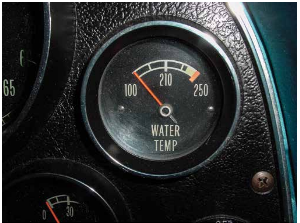
The gauge you hate to look at if your cooling system isn't up to snuff; verify its accuracy with an I.R. gun so you know what it's really telling you.

Corvettes use an electric temperature gauge, driven by a sending unit in the intake manifold or cylinder head. The sending unit sensing element is directly exposed to the coolant leaving the engine and contains a thermistor (temperature-sensitive variable resistor). 12 volts is supplied to the gauge, which is then connected through a wire to the terminal on the sending unit. At the sending unit, the 12 volts go through the thermistor element to ground through the threads on the sending unit. The varying resistance of the thermistor (with coolant