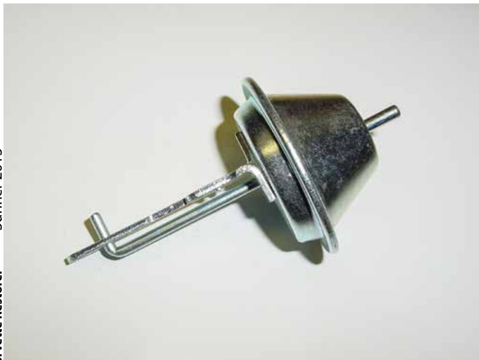
For optimum idle and low-speed cooling, a vacuum-advance unit must be calibrated to idle vacuum level and connected to a full manifold vacuum source, not to ported vacuum.

the vacuum advance fully-deployed. You'll also need an advance can calibrated so it's fully-deployed with at least 2" Hg. less vacuum than the engine develops at idle (about $10 at NAPA).