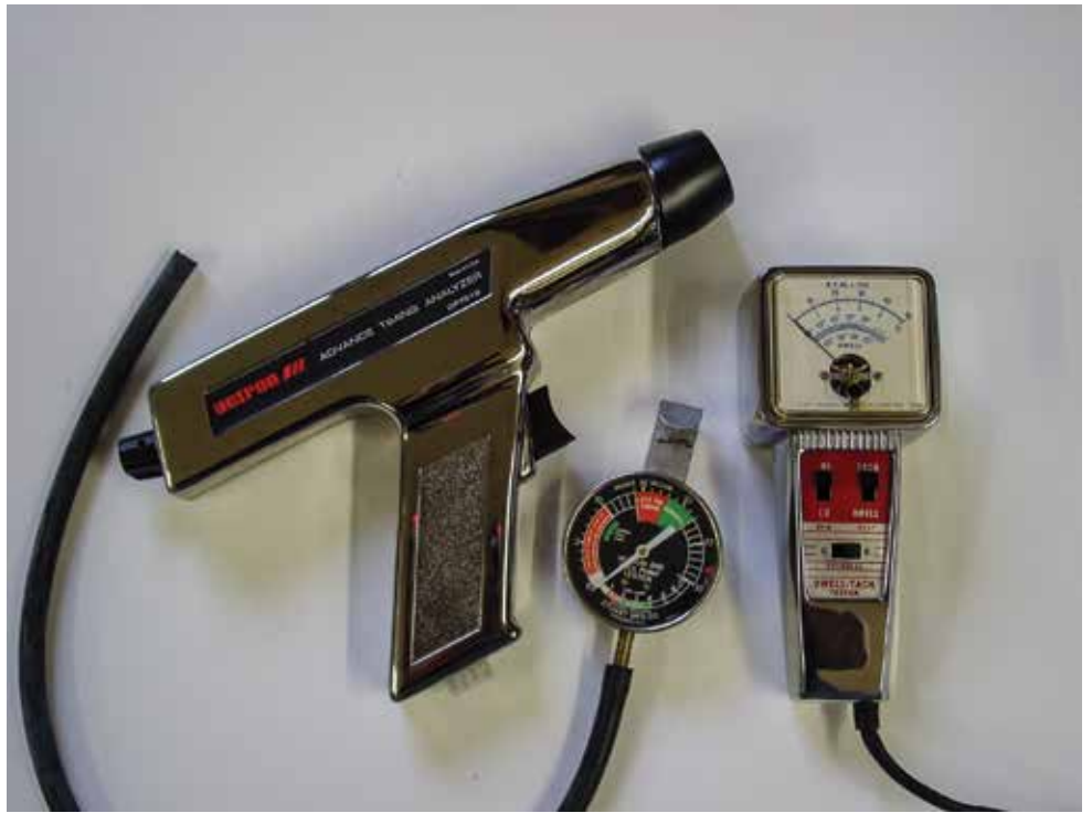
Basic tune-up tools are essential to set dwell, set and map timing and advance curve, and adjust idle mixture.

Keep your Corvette cooling system in top shape and you can watch the scenery while cruising instead of the temperature gauge.