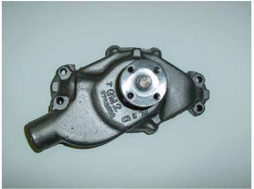
The stock Corvette water pump was designed and developed to meet the needs of the cooling system; you don't need a race water pump.

Stock water pumps work just fine; there's no need for high-flow or race pumps unless you like their appearance. NASCAR race pumps are uniquely designed so they won't cavitate at 9,000 rpm while moving coolant that has to absorb the heat from constant wide-open throttle from