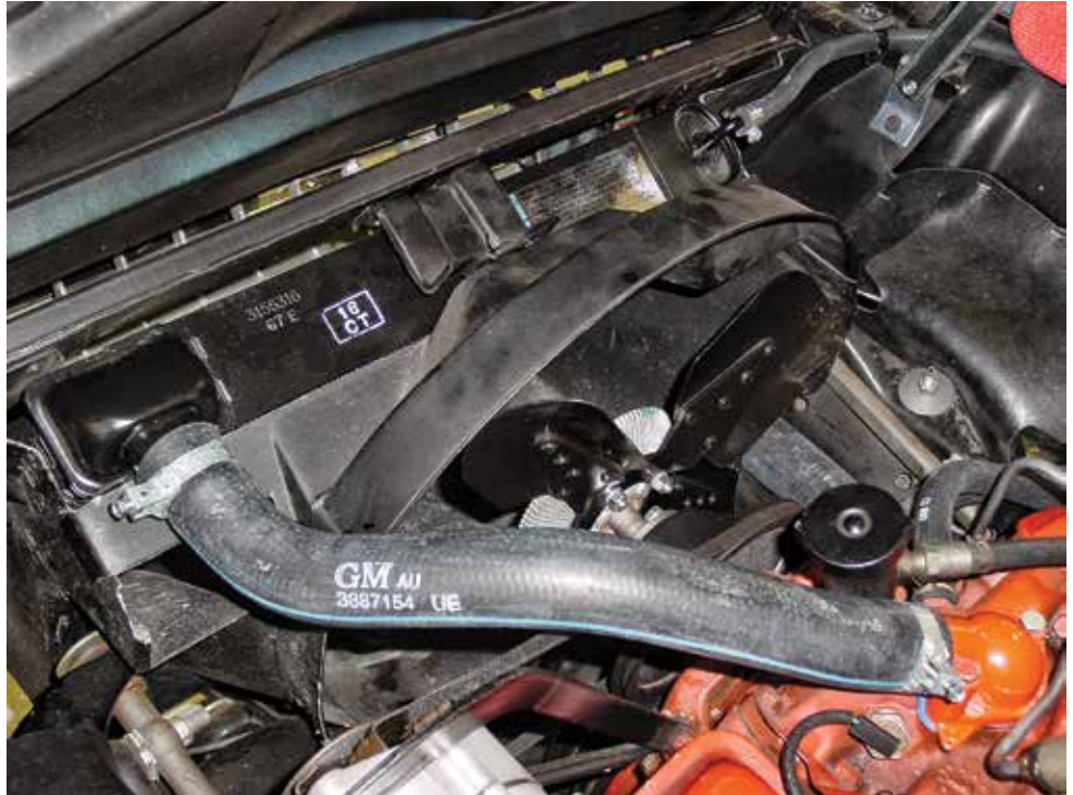
An overview of the complete cooling system on Corvettes

As coolant exits the front of the heads and flows into the crossover passage from both sides, it encounters the thermostat. If the engine hasn't warmed up yet, the closed thermostat stops coolant flow until the coolant has absorbed enough heat to open the thermostat. If the engine has already warmed up and the coolant is hot, it flows through the calibrated opening in the thermostat and proceeds into the upper radiator hose.