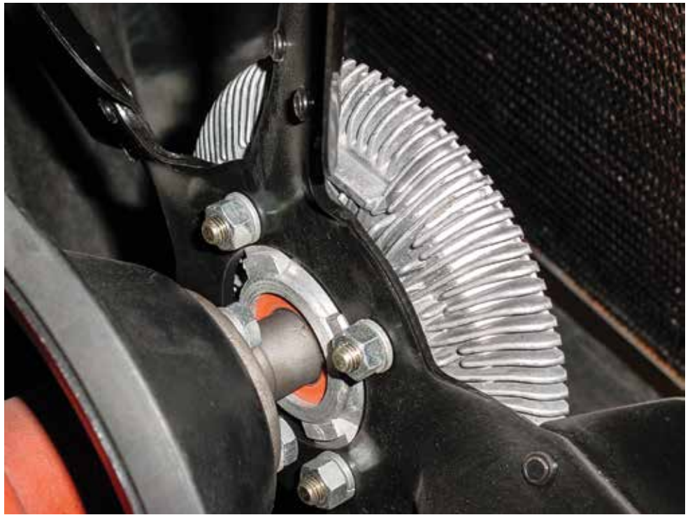
The thermo-modulated Corvette fan clutch is key to idle and low-speed airflow and far more efficient than any flex-fan.

the radiator at highway speeds. Factory fans are very carefully designed for maximum efficiency (and minimum noise, which is why the blade positions are staggered) and designed to provide maximum efficiency when the tips of the blades are half-in/half-out of the rear edge of the shroud, with approximately one-half-inch clearance from the blade tips to the shroud. The radiator/shroud/fan combination on each Corvette is the result of a lot of tedious hot-weather development work by the engineers who designed it. The original system is tough to improve on, assuming that all the components of the cooling system are functioning properly and haven't been butchered, altered, removed, substituted, or backyard-catalog-engineered to improve them. These cars didn't overheat under normal conditions when they were new, and they shouldn't now if the system is still composed of the correctly-configured components.