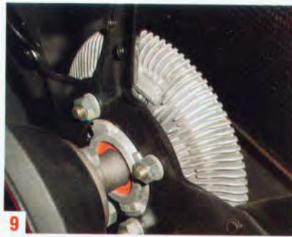
9 The thermo-modulated Corvette fan clutch – key to idle and low-speed airflow, and far more efficient than any “flex-fan”.

cold; OEM testing has proven that the rate of cylinder bore and piston ring wear at 160 degrees is double the wear rate at 180 degrees, and a coolant temperature of 160 degrees won't let the oil in the pan get hot enough to boil off condensed moisture and blow-by contaminants, which then remain in suspension and accelerate the formation of acidic sludge. In the 1930s, 160-degree thermostats were specified for the old alcohol-based antifreezes, which would boil off and evaporate at 185 degrees. There's no other reason for them.