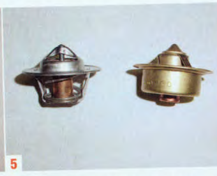
5 A conventional thermostat on the left, and a balanced-flow type on the right; the balanced-flow type is more accurately calibrated.