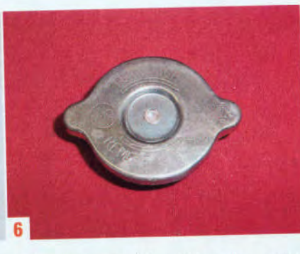
6 The radiator cap, which maintains system pressure, vents overflow, and admits air on cooldown. Most auto parts stores can verify its seal and pressure calibration.

hasn't seen regular coolant changes has lost anywhere from 20 to 40 percent of its heat transfer capability, although it may look good. Don't be fooled by a "flow test" at a radiator shop—all that tells you is that the radiator isn't plugged or severely restricted. It can't measure the radiator's heat transfer capability, which is what really counts. When the time finally comes to replace your radiator, don't be tempted to buy on price. Buy a quality radiator that at least matches the