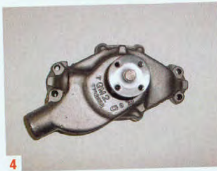
4 The stock Corvette water pump, designed and developed to meet the needs of the cooling system; you don't need a "race" water pump.