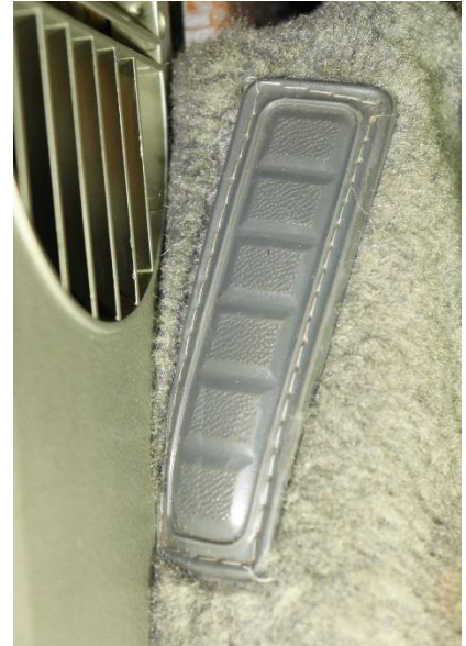
Fig. I 2.5 Dimmer-switch pad

The second design placed the corvette script in the toe portion of the floor mat and the two-tone feature was changed to a single color. (See Fig I. 2.8)