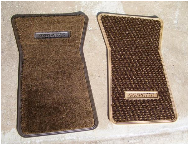
Fig. I 2.8 RPO B32 – 1978 vs. 1977