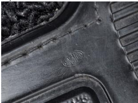
Fig. I 2.6 For reference only: Heel pad IMCO logo pre-1972

Chevrolet Production Assurance learned that the embedded script hindered driver foot operation. Buyers also reported that the carpet separated from the rubber base, due to the poor bonding quality of the adhesive. As a result, some evidence exists that the adhesive was changed March 1977, improving adherence. 6 (See Fig I. 2.8)