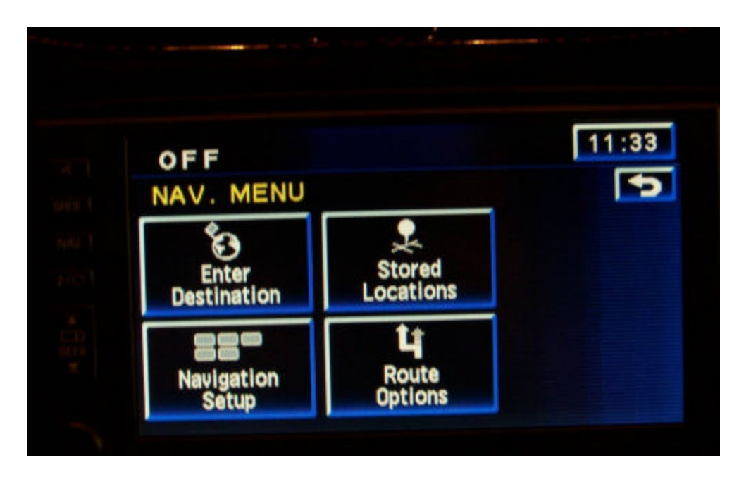
Select Enter Destination

On to the next installment in our Corvette factory navigation tutorial and taking up where we left off in the last section, from the map screen we need to get back to the main menu.