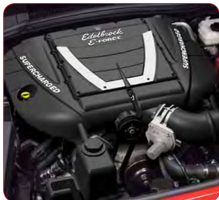
2010 Camaro Supercharger Kit #1598 Installed