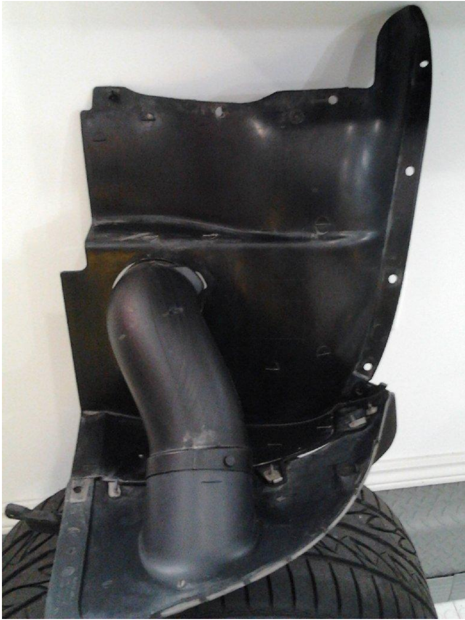
The wheel liner pulled out from the vehicle in one piece. This picture is of the rear of the liner showing the cooling duct attached.