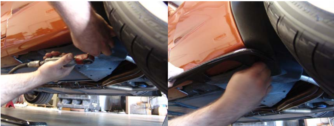
Figure 4: Starting Rocker Install

Now that the mud flap and rocker are loosely lined up on the car you will need to attach the rocker panel to the mud flap at the lower point. You will see two holes in the flap and two holes in the rocker panel already there. Use the two supplied 3/16” rivets with back up washer on the inside rivet. Go ahead and snap the rivets in place at this time with a hand held rivet gun.