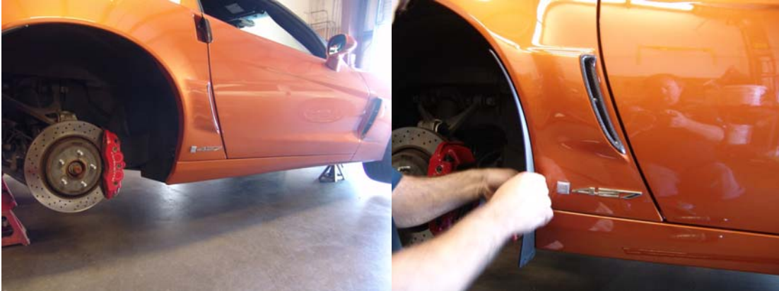
Figure 3: Removal of rear wheel and install of ‘mud flap’

Once you have the one bolt in the flap you will now start by mocking up the rocker panel. You will start by removing two screws at the front fender under the car and these will be used to locate the rocker to the car. Lay the rocker panel up against the car and start the two screws at the front. DO NOT TIGHTEN THESE YET!