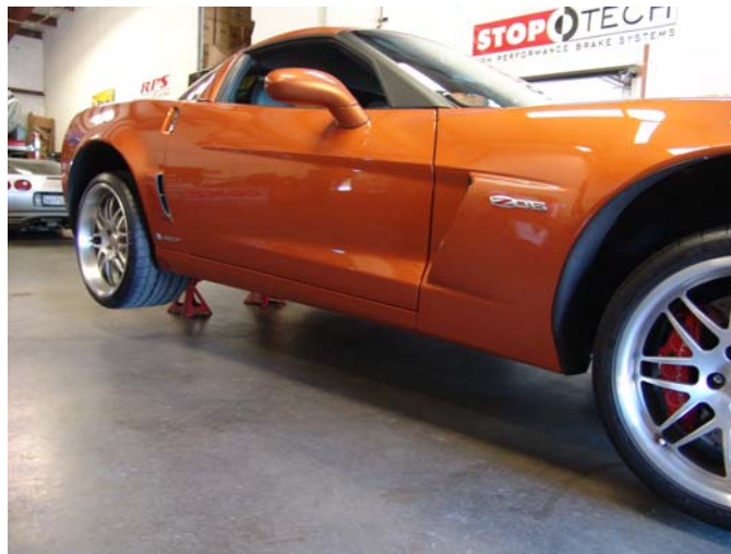
Figure 2: Support and Clean

Start your install by supporting the car with 4 jack stands on a level surface about 12” or more off of the ground. Take some time to wash the area that the rockers are going on, as you do not want to trap any dirt or debris between them and the paint of the car.