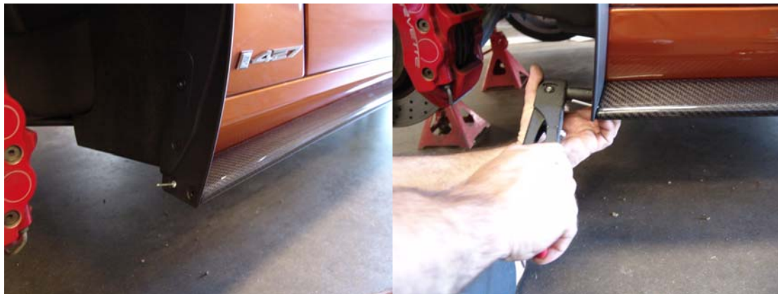
Figure 5: Installing Mud Flap to Rocker Panel

Now that the two pieces are joined you will need to drill the remaining attachment points into the rear fender and lower rocker panel. Use the supplied rivets to attach the mud flap to the car first then work to the rocker panel.