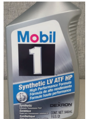
New quart bottle

TIP: Mobil 1 Synthetic LV ATF HP transmission fluid is required for all 8-speed transmission repairs regardless of the repair being completed.