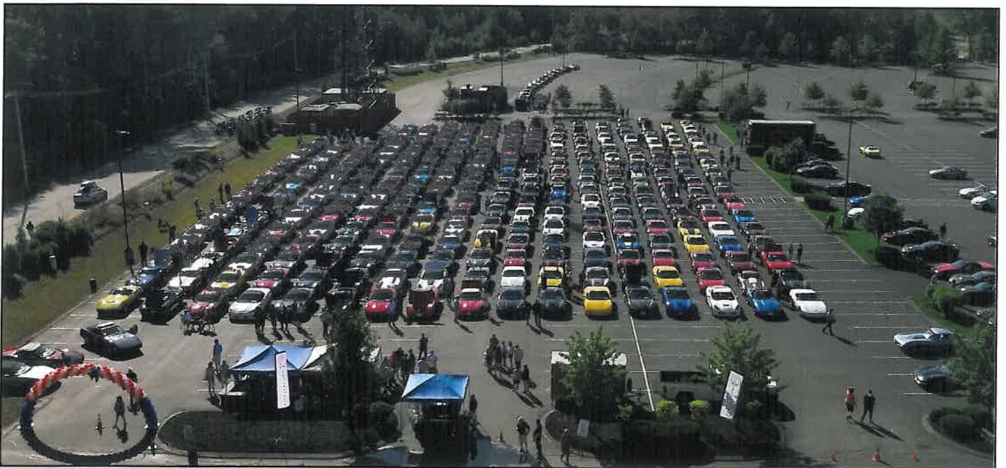
14th Annual Vettes to Vets Event 2017, staging area, Marriott Hotel

Please make checks payable to Vettes to Vets and note 'GPF 9001' in the memo section of the check.