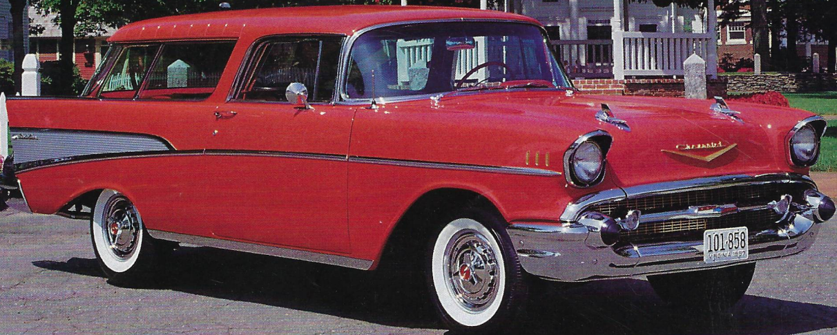
Earl Smithson's Red Beauty

Tech Help: ANTI-LOCK ABS BRAKE SYSTEM INSTALLATION SPECIAL 20TH ANNIVERSARY EDITION