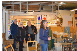
Glass Blowing Class