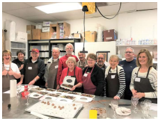
Chocolate Making Class

The Club attends other Corvette club car shows and meetings throughout Washington